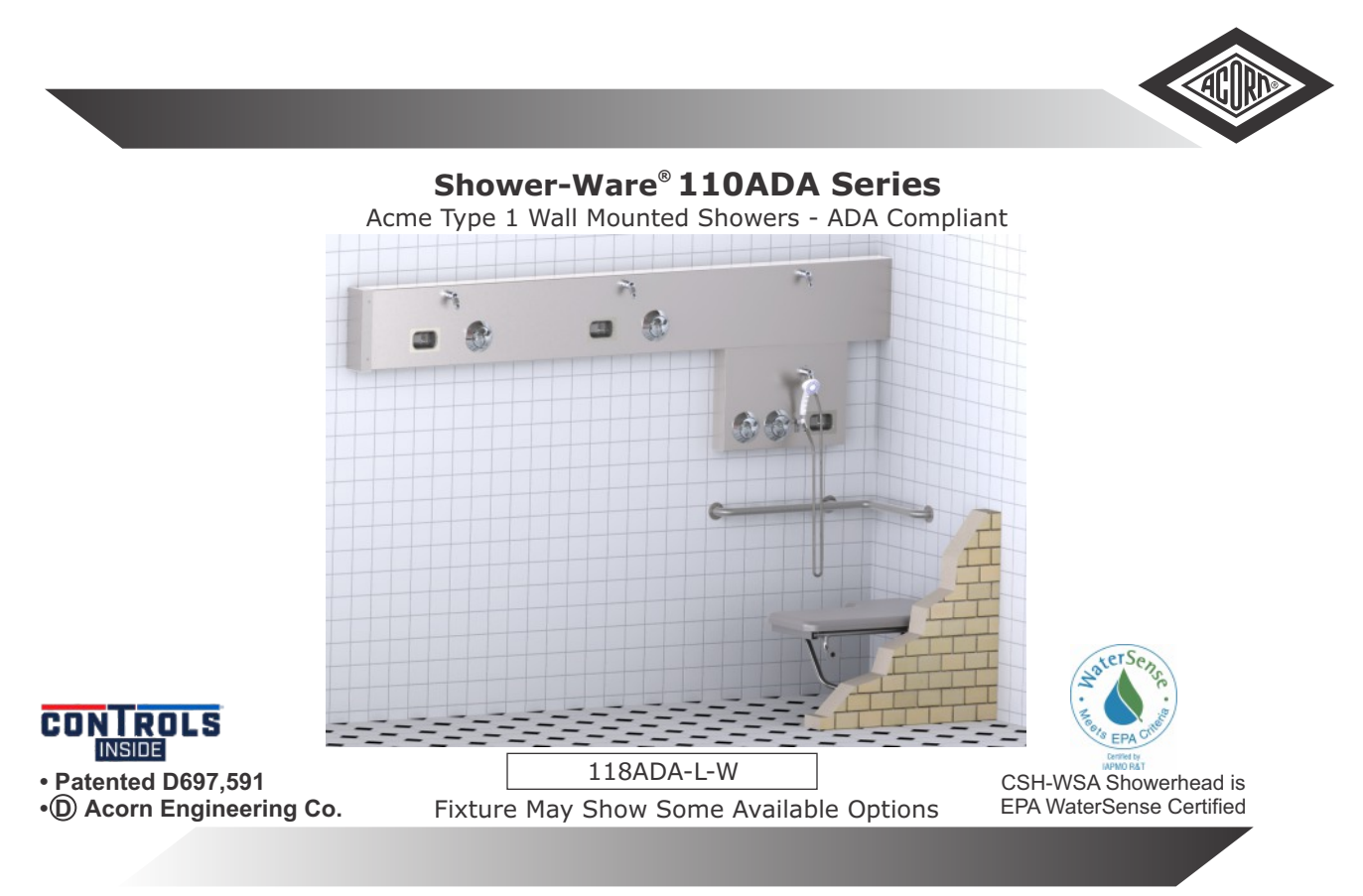
Please visit www.acorneng.com for most current specifications.