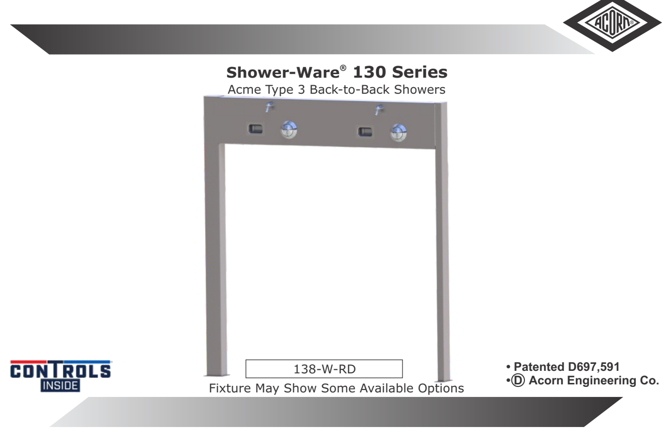
Please visit www.acorneng.com for most current specifications.