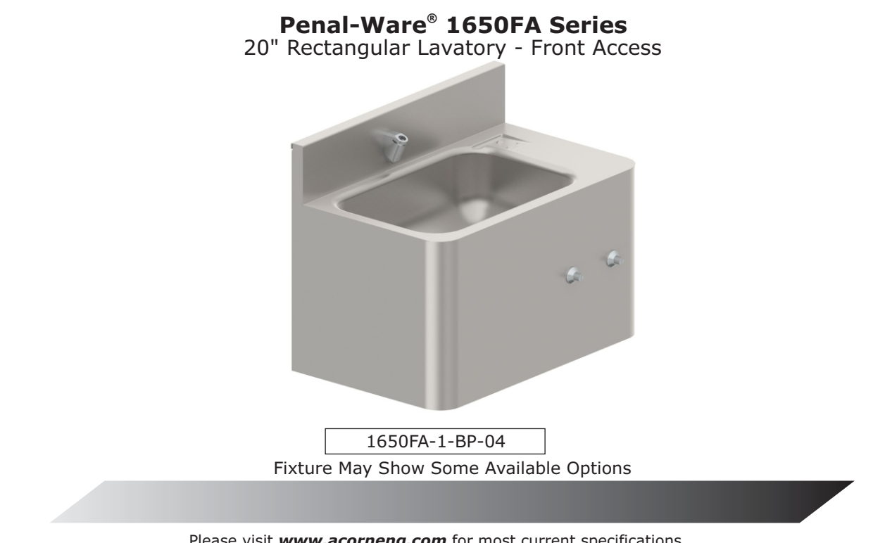
Please visit www.acorneng.com for most current specifications.