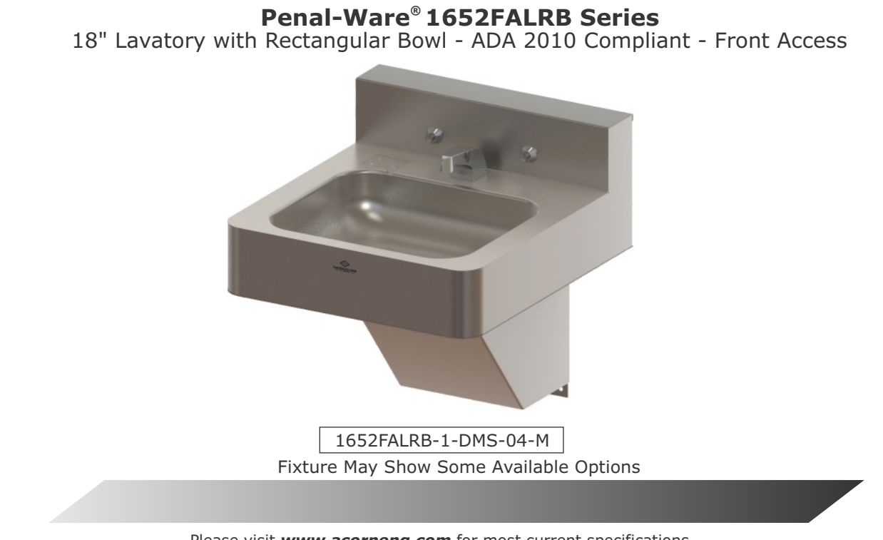
Please visit www.acorneng.com for most current specifications.