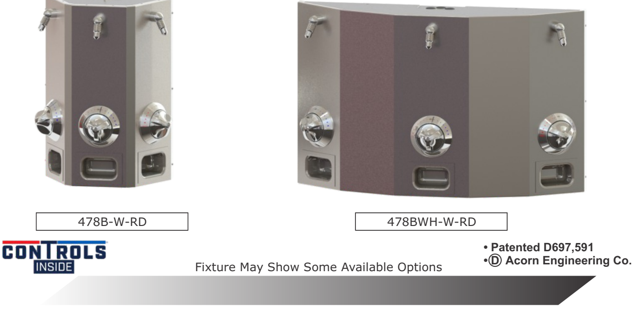
Please visit www.acorneng.com for most current specifications.