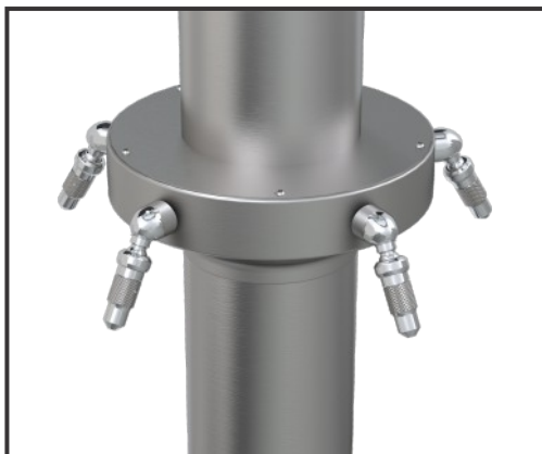
-SC Column Shower - 700 Series Shown