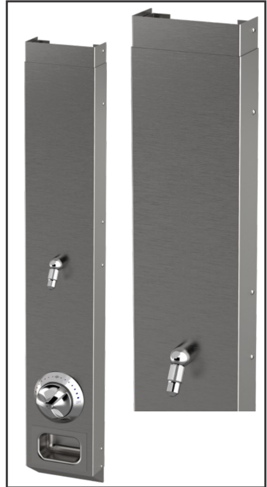
-SC Wall Mount Shower - 450B Shown

The stainless steel cover pictured conceals supply and/or vent pipes providing a finished appearance and includes an upper and lower section which telescope to provide adjustment.