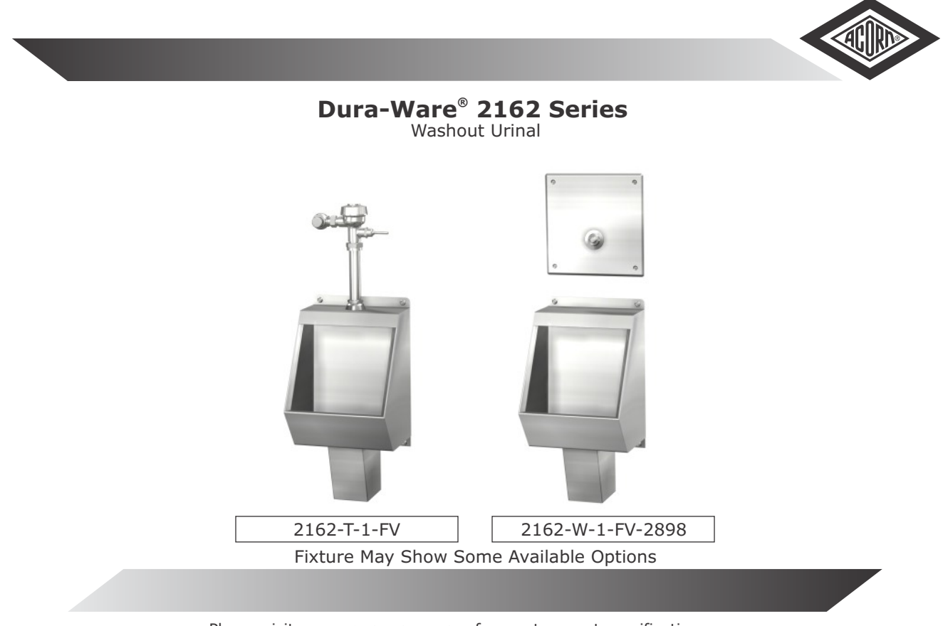
Please visit www.acorneng.com for most current specifications.