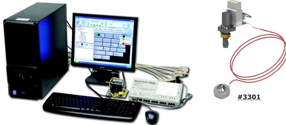
3301 MASTER-TROL SYSTEM