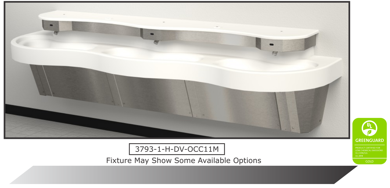
Please visit www.acorneng.com for most current specifications.

Corterra® Kurve Three-Station Washbasin - ADA/CBC Compliant