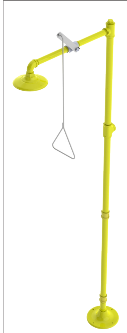
Model Shown: Acorn Safety S1300 Drench Shower

This is an information page only. Contact Chronomite at 800-447-4962 or www.chronomite.com for technical data, sizing information and application.