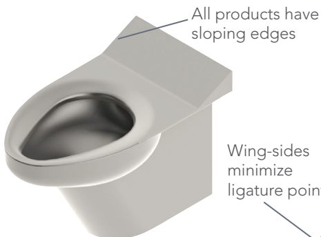
Model No: LR2141