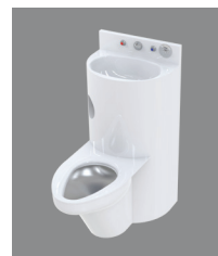
Model No: LR1418

White Enviro-Glaze® available at no extra cost.