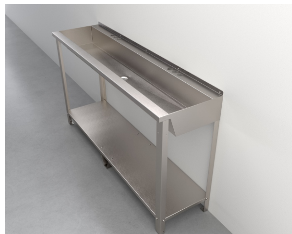
SW260 - 4LF260-34

Fixture May Show Some Available Accessories