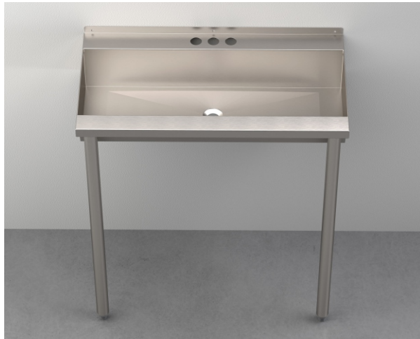
SW130 - SW000-34