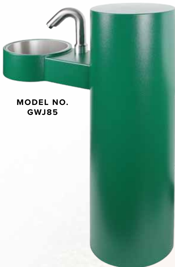
MODEL NO. GWJ85

A Wash-N-Go! model can be a simple outdoor sink station, or it can combine a hand wash fountain with water fountain, water bottle filling station, and pet fountain for service animals. It comes in four standard colors, and can be matched to any existing Pantone® shade for complete customization freedom.