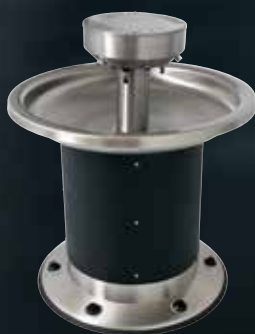
MODEL NO. 3503