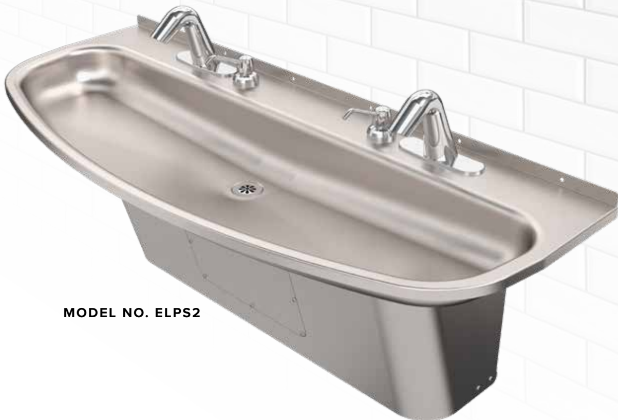
MODEL NO. ELPS2