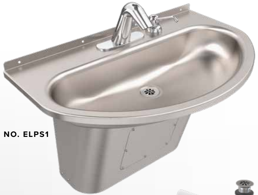
MODEL NO. ELPS1