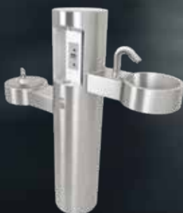
MODEL NO. GYQ84-65