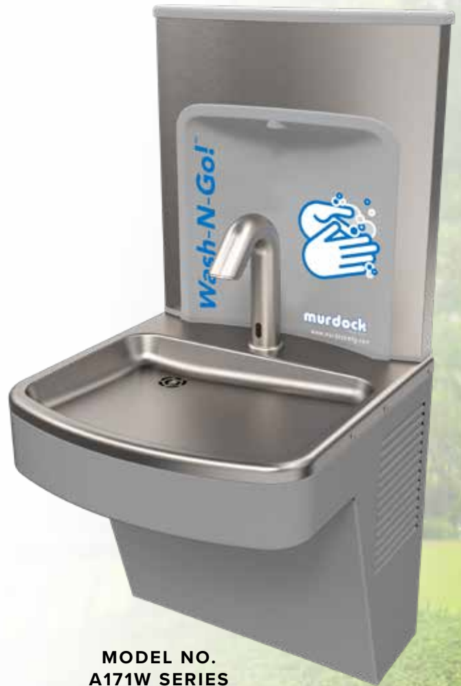
MODEL NO. A171W SERIES

SEE ALL THE WASH-N-GO! MODELS AT THE MURDOCK WEBSITE.