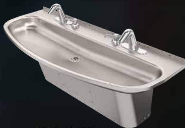
MODEL NO. ELPS2